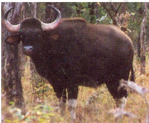
Fig. 7.5 : Wild buffalo

buffaloes (Fig. 7.5) and barasingha (Fig. 7.6) were also found in the Satpura National Park. Animals whose numbers are diminishing to a level that they might face extinction are known as the endangered animals . Boojho is reminded of the dinosaurs which became extinct a long time ago. Survival of some