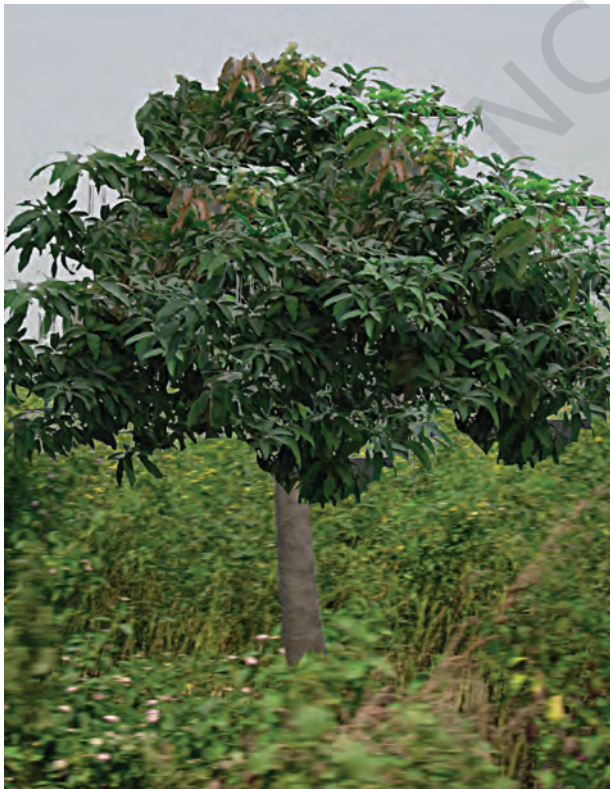
Fig. 7.3 (a) : Wild Mango

Madhavji shows sal and wild mango (Fig. 7.3 (a)) as two examples of the