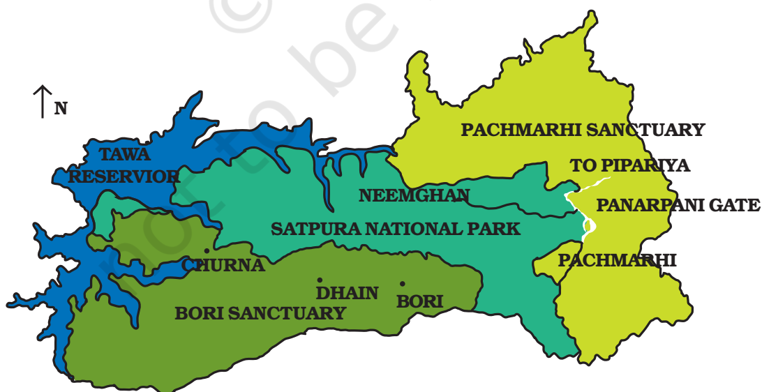
Fig. 7.1 : Pachmarhi Biosphere Reserve