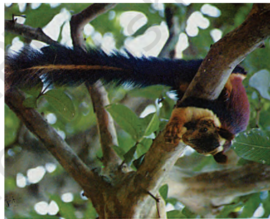
Fig. 7.3 (b) : Giant squirrel

endemic flora of the Pachmarhi Biosphere Reserve. Bison, Indian giant squirrel [Fig. 7.3 (b)] and flying squirrel are endemic fauna of this area. Professor Ahmad explains that the destruction of their habitat, increasing population and introduction of new species may affect the natural habitat of endemic species and endanger their existence.