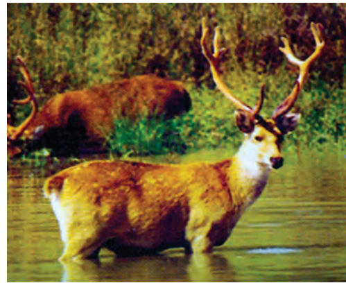
Fig. 7.6 : Barasingha

animals has become difficult because of disturbances in their natural habitat. Professor Ahmad tells them that in order to protect plants and animals strict rules are imposed in all National Parks. Human activities such as grazing, poaching, hunting, capturing of animals or collection of firewood, medicinal plants, etc. are not allowed